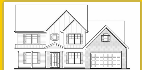
TURNER F Base Price: $982,500 3,039 sqft 4 Beds 3.5 Baths