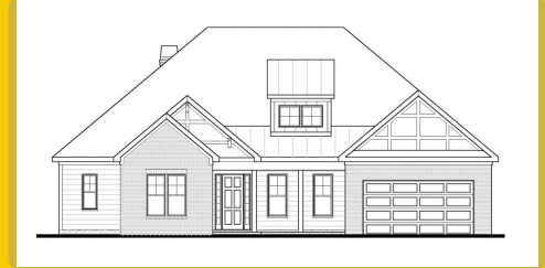
BRANTLEY F Base Price: $965,700 2,660 sqft 4 Beds 3 Baths