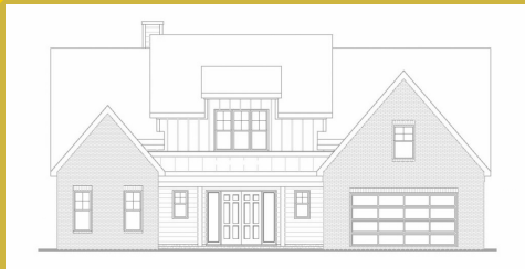
HARPER F Base Price: $1,033,800 3,832 sqft 5 Beds 4 Baths