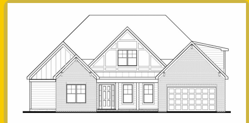
GORDON F Base Price: $1,041,700 3,507 sqft 5 Beds 4 Baths