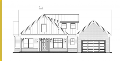
BELLINGER F Base Price: $998,500 2,807 sqft 4 Beds 3 Baths