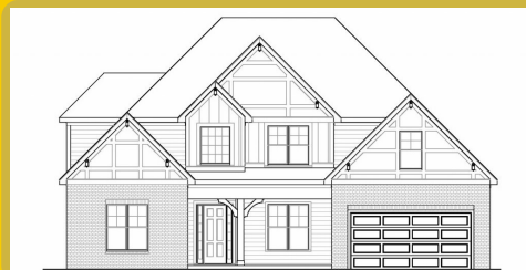
MURPHY F Base Price: $1,045,700 3,695 sqft 5 Beds 4 Baths