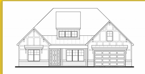
HARRIS F Base Price: $988,900 2,948 sqft 4 Beds 3 Baths