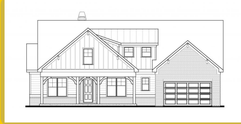
BELLINGER F Base Price: $998,500 2,807 sqft 4 Beds 3 Baths