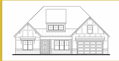
HARRIS F Base Price: $988,900 2,948 sqft 4 Beds 3 Baths