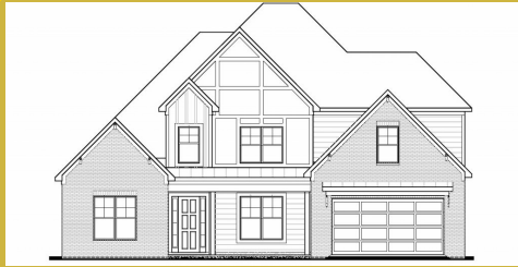
ANDERSON F Base Price: $1,039,900 3,505 sqft 4 Beds 3.5 Baths