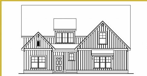
CRAWFORD A XL Base Price: $644,900 3,108 sqft 4 Beds 4 Baths