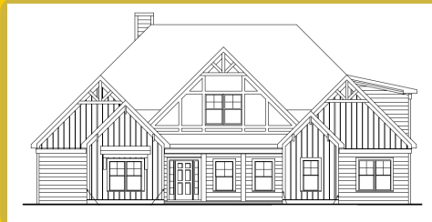
GORDON A Base Price: $685,900 3,507 sqft 5 Beds 4 Baths