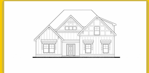
DAVIS A Base Price: $585,900 2,598 sqft 4 Beds 3 Baths