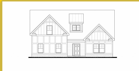
MORTON A Base Price: $578,500 2,421 sqft 4 Beds 3 Baths