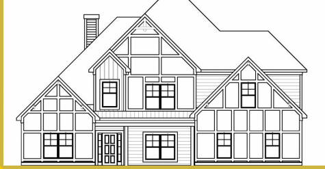
ANDERSON A Base Price: $669,900 3,505 sqft 4 Beds 3.5 Baths