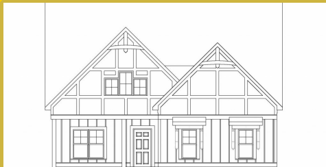
DAWSON A Base Price: $594,700 2,441 sqft 4 Beds 3 Baths