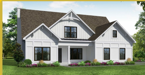
DANSBY A Base Price: $614,500 2,628 sqft 4 Beds 3 Baths