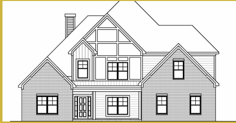
ANDERSON F Base Price: $726,500 3,505 sqft 4 Beds 3.5 Baths