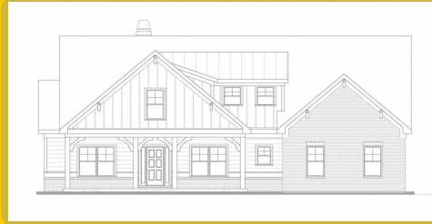
BELLINGER F Base Price: $674,500 2,807 sqft 4 Beds 3 Baths