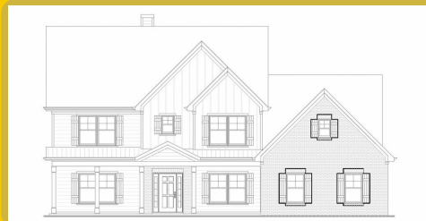
TURNER F Base Price: $694,500 3,079 sqft 4 Beds 3.5 Baths

SALES CENTER Stallings Road Senoia, Georgia 30276