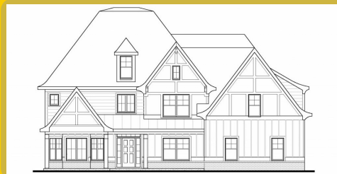
JACKSON F Base Price: $834,900 5,259 sqft 5 Beds 5.5 Baths