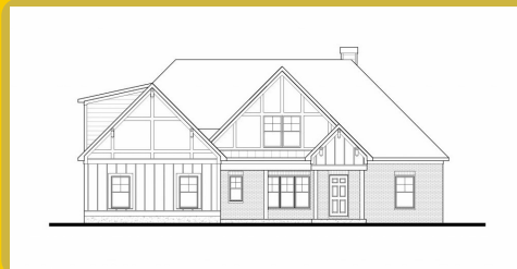
CARAY F Base Price: $685,900 2,792 sqft 5 Beds 3.5 Baths