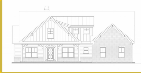
BELLINGER F Base Price: $674,500 2,807 sqft 4 Beds 3 Baths