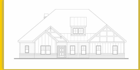
BRANTLEY F Base Price: $664,500 2,660 sqft 4 Beds 3 Baths