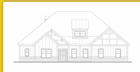
BRANTLEY F Base Price: $664,500 2,660 sqft 4 Beds 3 Baths