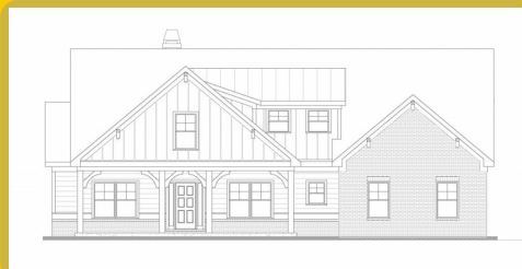
BELLINGER F Base Price: $674,500 2,807 sqft 4 Beds 3 Baths