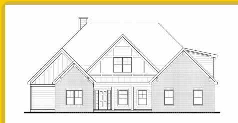
GORDON F Base Price: $726,900 3,507 sqft 5 Beds 4 Baths