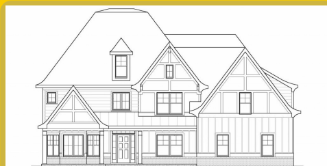
JACKSON F Base Price: $834,900 5,259 sqft 5 Beds 5.5 Baths