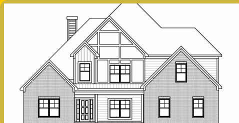
ANDERSON F Base Price: $726,500 3,505 sqft 4 Beds 3.5 Baths