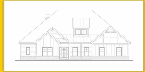
BRANTLEY F Base Price: $664,500 2,660 sqft 4 Beds 3 Baths