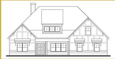
HARRIS F Base Price: $673,700 2,948 sqft 4 Beds 3 Baths