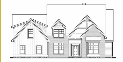
BRYANT B 90

Base Price: $849,900 3,635 sqft 4 Beds 4 Baths