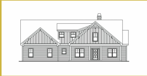
BENSON A XL

Base Price: $729,900 2,977 sqft 4 Beds 3 Baths