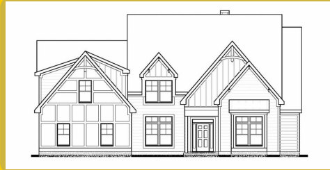
BRYANT A 90

Base Price: $729,900 2,977 sqft 4 Beds 3 Baths