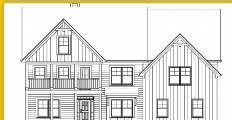
STERLING A Base Price: $881,900 5,291 sqft 5 Beds 5.5 Baths