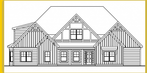
GREYWELL A Base Price: $794,500 3,662 sqft 5 Beds 4 Baths