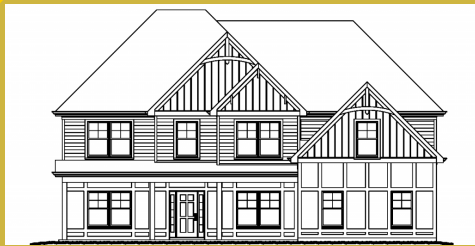
MILLWOOD A Base Price: $748,700 3,463 sqft 5 Beds 4 Baths