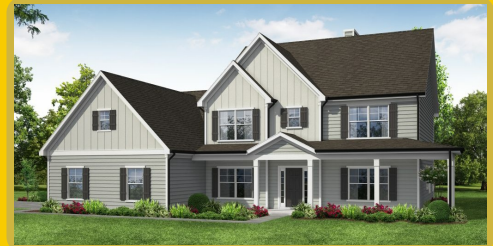
PALMER A Base Price: $735,700 3,223 sqft 4 Beds 3.5 Baths