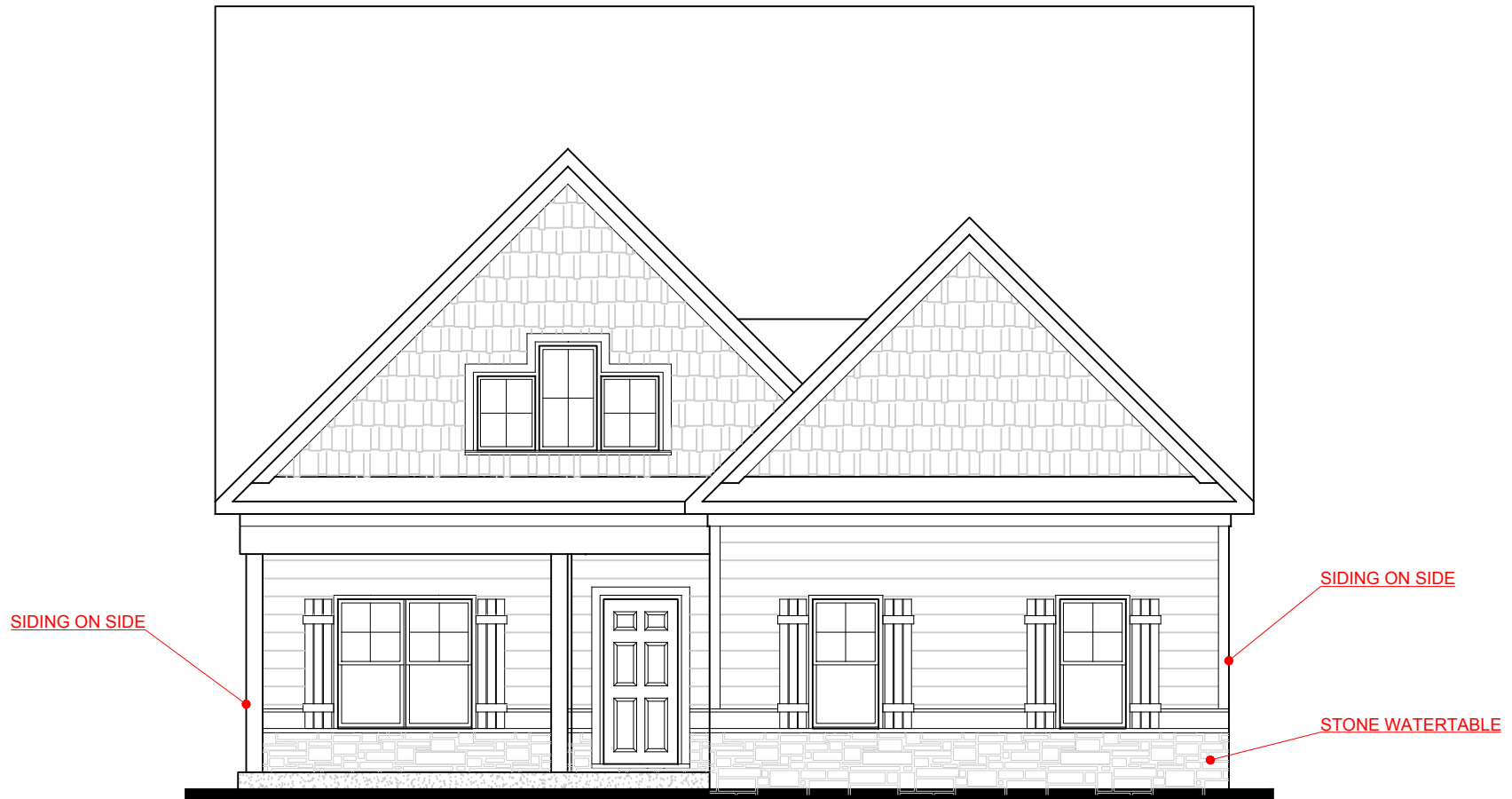
FRONT ELEVATION- B VERSION