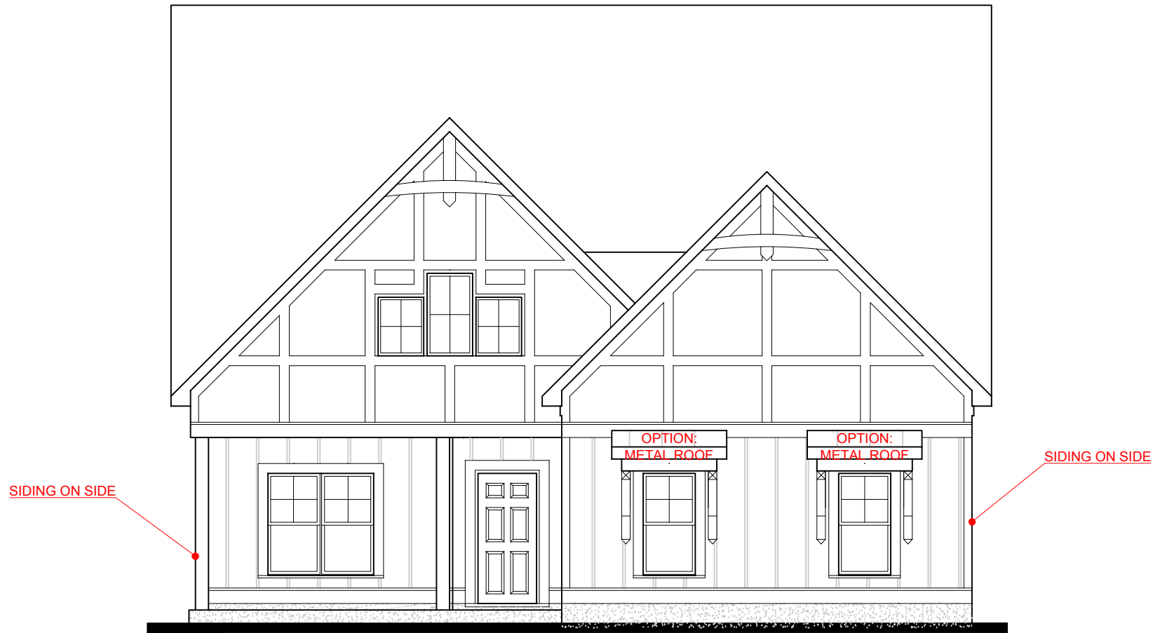
FRONT ELEVATION- A VERSION